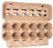
Old Egg Carton